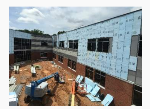
Windows & Metal Panels at Courtyard