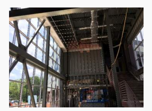
Lobby Window Wall, Duct, Ceiling Grid, & Gyp. Bd.