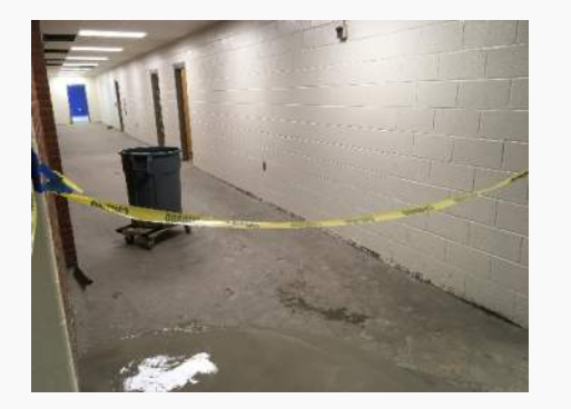
Ceiling Tile at Renovation