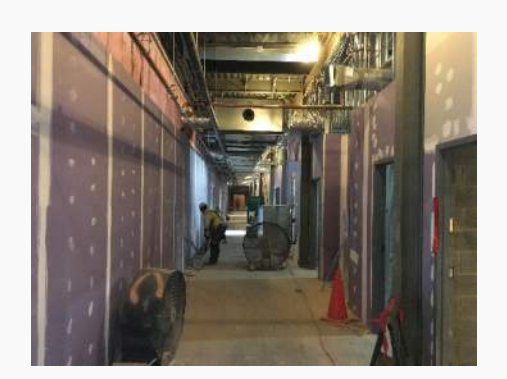
Drywall, Hang, Tape, & Finish