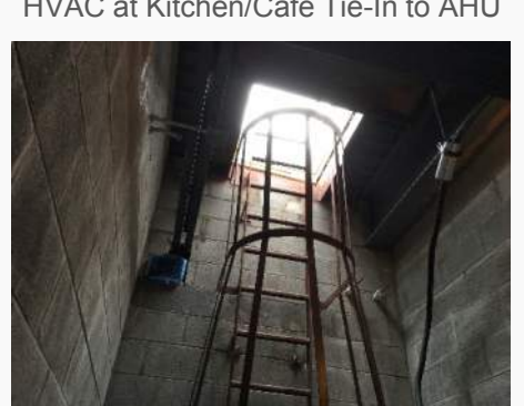
Roof Hatch & Ladder