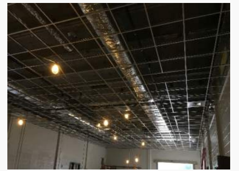
Ceiling Grid at Auditorium