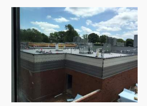
Metal Panels & Roof Top Equip. at Kitchen