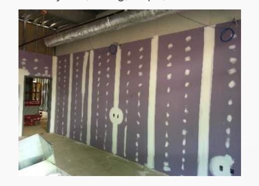
Drywall, Hang, Tape, & Finish