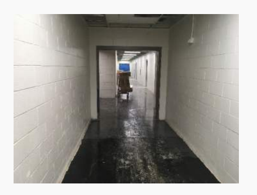
Wall Tile at Reno Restrooms