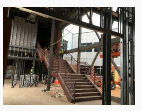
Installing Window Walls at Lobby