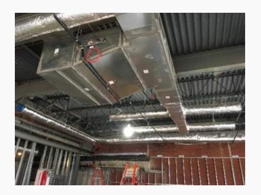
HVAC at Kitchen/Cafe Tie-In to AHU