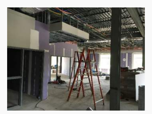
Media Center Soffits, MEP, & Gyp Bd.