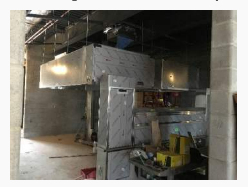
Kitchen Hood & UDS