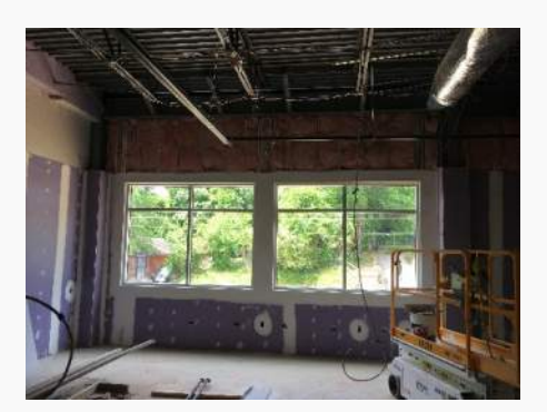
Gyp. Bd. Tape & Finish at Windows