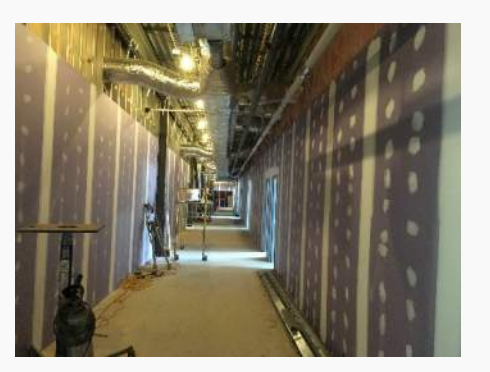
Two-Siding Gyp. Board Upper Level